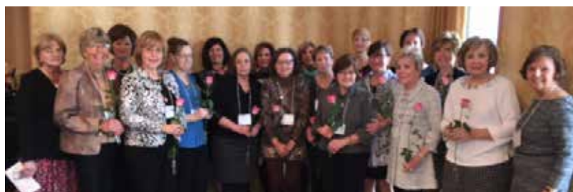
Provisional Class of 2017